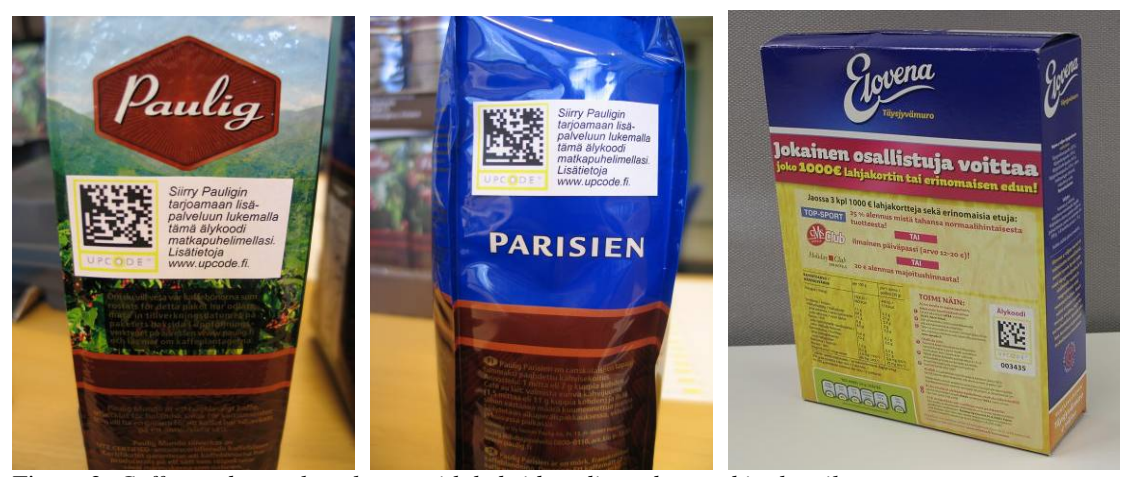
Figure 2. Coffee and cereal packages with hybrid media codes used in the pilot tests.

Based on the user studies the service could include: